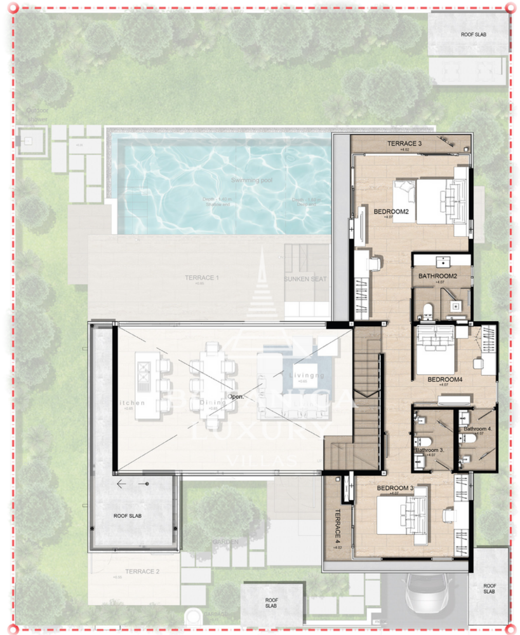
Upper Floor Plan

Internal Area : 228 External Area : sq.m. 182 : All Area : sq.m. 410 sq.m.